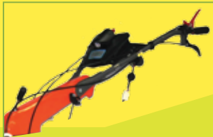
Handle-bar with LED light