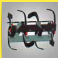
Wet Land Blades