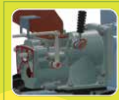
6 Gears Shifting Gear Box