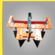
5 Tynes Cultivator