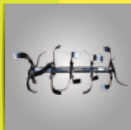
Dry Land L - Type Blades